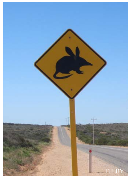
Certainly some interesting creatures here!

Sadly our two year stay in London had come to an end, our options were discussed and the decision was made to move a little closer to home. Perth Western Australia it was to be, although still seven hours flight time away.